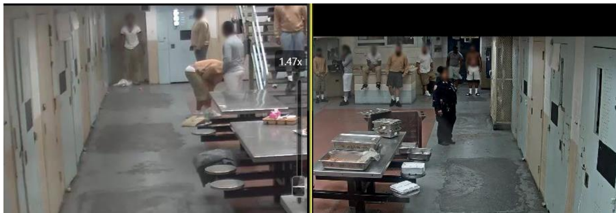
Picture 5: The victim stumbles to his feet and remains surrounded by individuals who assaulted him. The Officer remains distant and fails to render aid or disperse the other individuals.