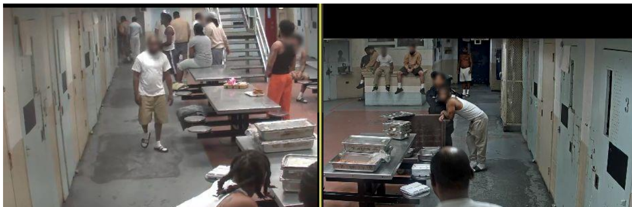
Picture 1: Numerous individuals enter an unsecured corner cell as the Officer on the floor watches.

Video footage of an incident on July 29, 2023 revealed the following: several incarcerated individuals in a general population housing area in GRVC were congregated in various places (dayroom tables, the top tier of the unit, and at the B post desk where a logbook was left unattended). Several cell doors were unsecured and cell door windows were obstructed. As nine incarcerated individuals who were congregating on the top tier descend the stairs, the B-post officer was standing across the housing unit, facing the stairway. Once on the bottom tier, six of the individuals opened and entered an unsecured cell, while the other three remained outside the cell. The B-post officer watched as the individuals entered the cell but took no action.