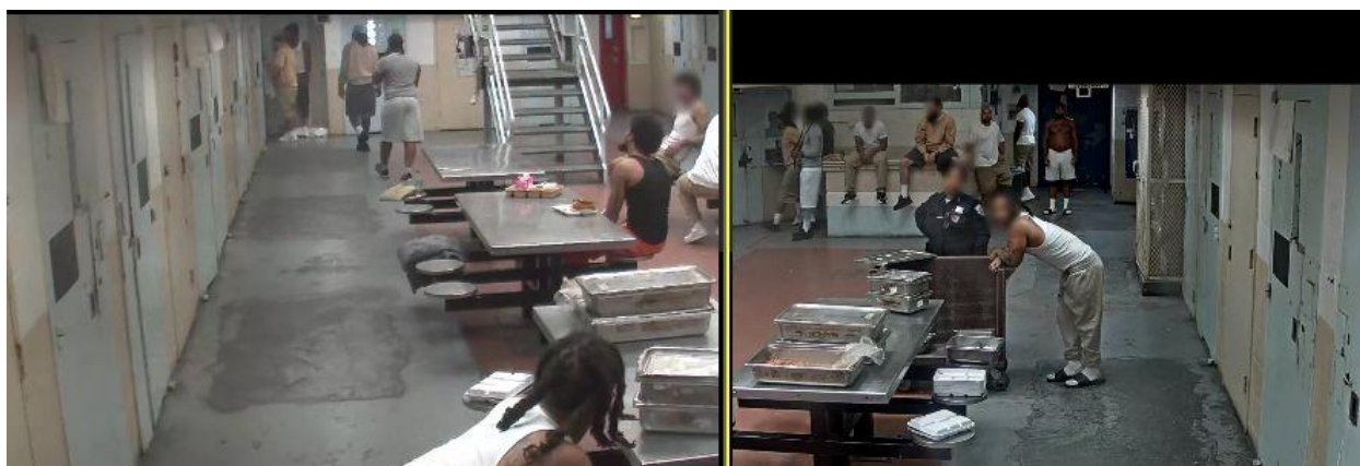
Picture 2: While individuals are inside the cell, several other individuals stand outside and look on. The Officer continues to watch from a distance and fails to intervene.