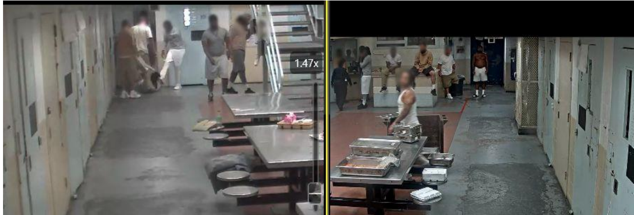
Picture 3: The individuals drag the victim from outside his cell, and he is kicked in the head. The Officer walks away from the incident.

Over two minutes later, several individuals exited the cell while dragging the victim, and proceeded to kick him in the head. The B-post officer, who had an unobstructed line of sight to the assault, took no action.