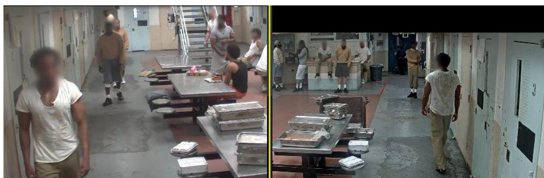
Picture 6: The victim walks to the Officer to exit the housing area. His shirt is visibly torn and covered in blood.

The victim exited the area with the B-post officer, who left the housing area unattended for over four minutes. Medical staff reported that the victim had multiple head and facial bruises and swelling, nasal deviation and fracture, and post-concussive syndrome. Medical staff referred the victim to EMS to rule out facial bone fracture, orbital fracture, and intracranial injury. The Department reported that the officer involved in this incident was suspended for 30 days, and an MOC was generated.